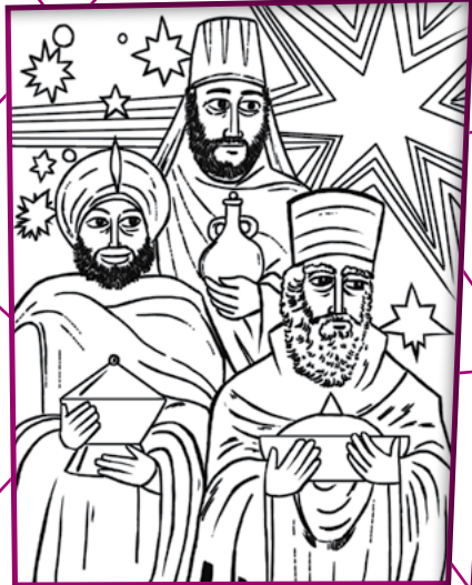
Sunday 5 th January