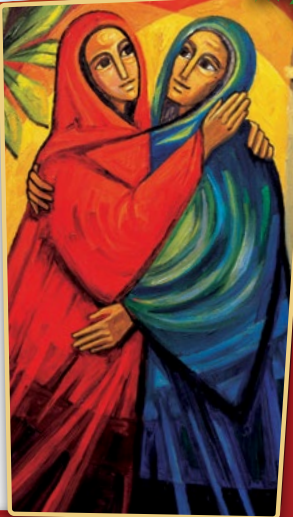
From the Gospel of Sunday 22 nd December 2024 - Luke 1:39-44 (the 4 th Sunday of Advent, Year C)

Mary had been told by an angel that she was to give birth to a son named Jesus. When she heard that her cousin, Elizabeth, was also going to have a baby, she went as quickly as she could to visit Elizabeth. Mary went into Zechariah's house and greeted Elizabeth. Now as soon as Elizabeth heard Mary's greeting, the child leapt in her womb and Elizabeth was filled with the Holy Spirit. Elizabeth gave a loud cry and said to Mary, "Of all women you are the most blessed, and blessed is the fruit of your womb. Why should I be honoured with a visit from the mother of my Lord? For as soon as your greeting reached my ears, the child in my womb leapt for joy. Yes, blessed are you for believing the promise made to you by the Lord."