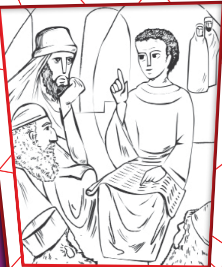
Sunday 29 th December