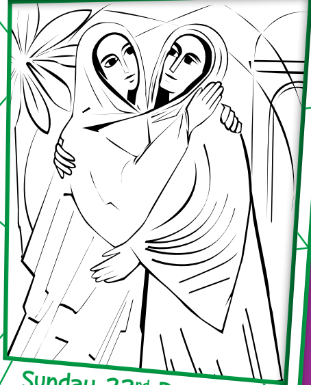
Sunday 22 nd December