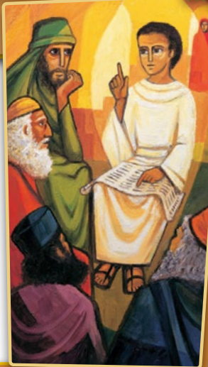
From the Gospel of Sunday 29 th December 2024 Luke 2:41-52 (the Feast of the Holy Family, Year C)

Every year Joseph and Mary went to Jerusalem to celebrate the feast of the Passover. When Jesus was twelve he went with them. After the feast, on the way home, Mary and Joseph realised that Jesus was missing from the group. So they went back to Jerusalem to look for him. After three days, they found Jesus in the Temple, listening to the teachers and asking them questions. The teachers were amazed at his intelligence. His parents were overcome when they found him and told him how worried they had been. "Why were you looking for me?" asked Jesus. "Did you not know that I would be in my Father's house?" Then Jesus went back home to Nazareth and lived in obedience to his parents. He grew in wisdom and grew in favour with God and the people.